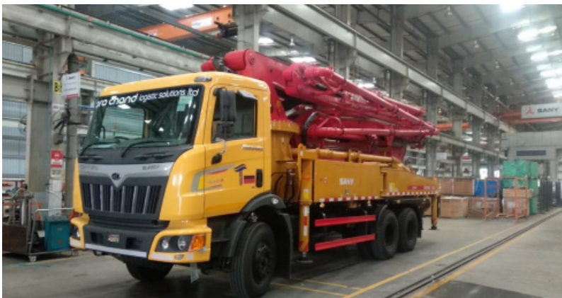
Concrete Boom Placers at Mumbai Metro Line 4