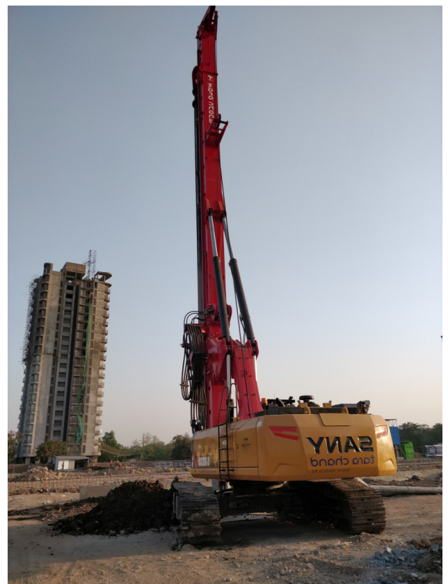
Hydraulic Piling Rigs at Mumbai Metro Line 4