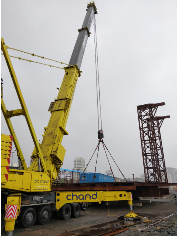
Liebherr LTM 1800, 800T Crane at Coastal Road Project, Mumbai