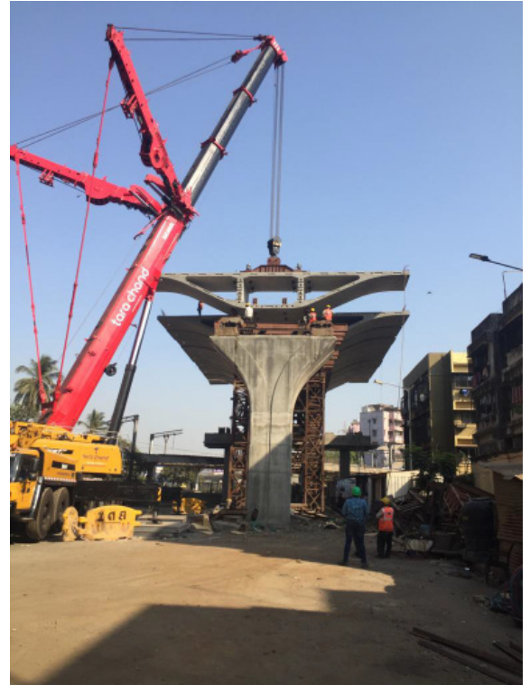
Precast Segment Erection by our 400T Crane at BKC, Mumbai