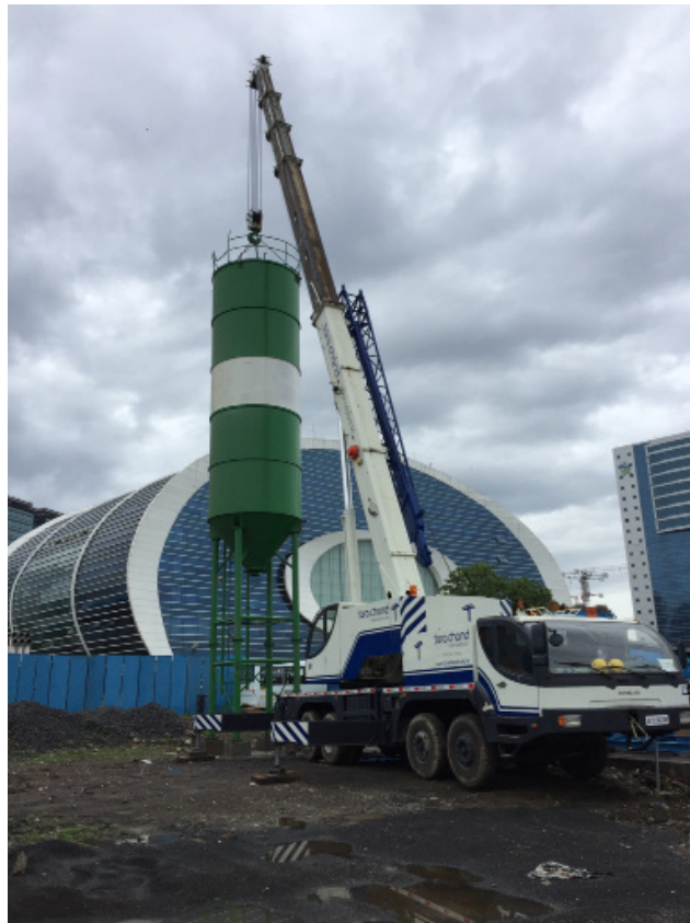
Metro works by 55T Truck Mounted Telescopic Crane