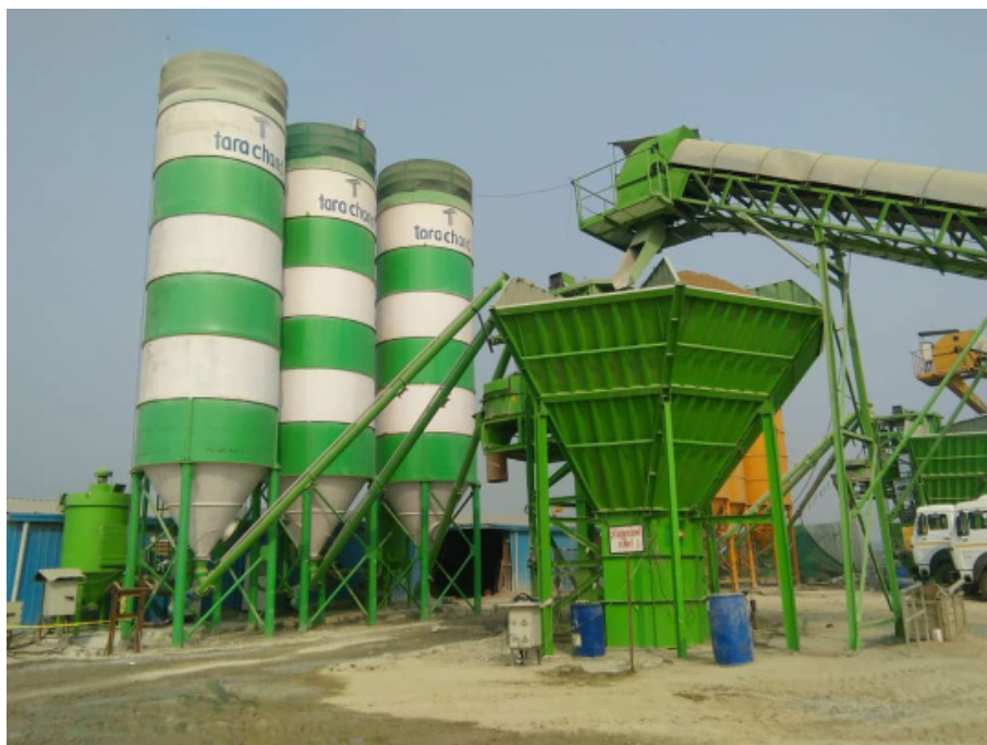
Concrete Batching Plant at New Ganga River Bridge Project, Patna