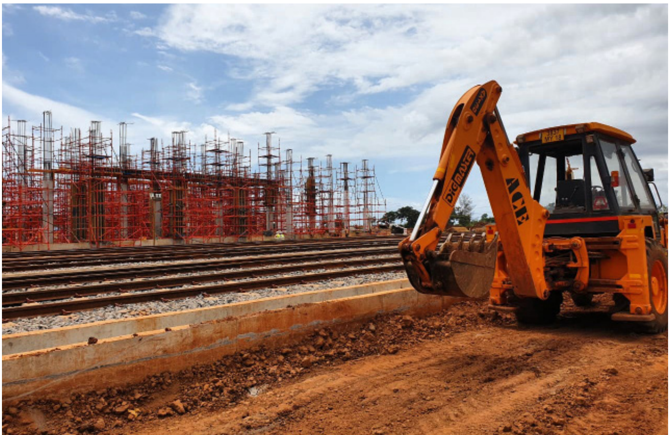
Light Metro Construction work at Mauritius with L&T