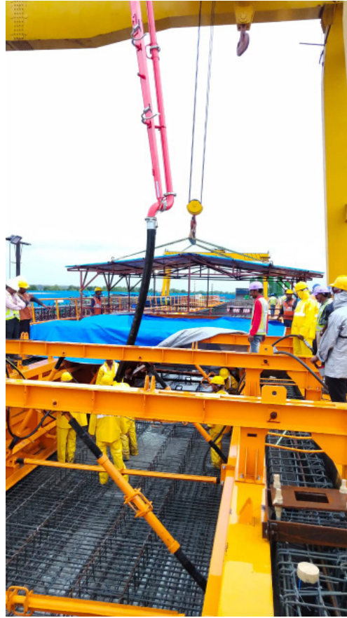
Precast Girder Casting for Mumbai Metro Line 4, Thane